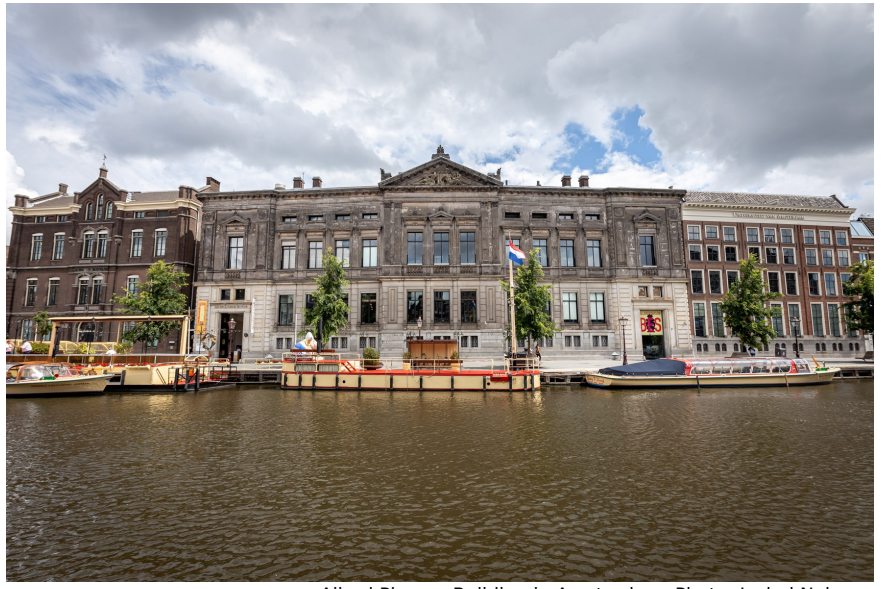
Allard Pierson Building in Amsterdam

The Allard Pierson is the museum and knowledge institute for the heritage collections of the University of Amsterdam. The museum joint ENICPA in 2021.