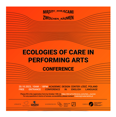
Participation is free. Conference language is English. Registration open till October 10th.

More and more arts organisations and funding institutions offer artists the opportunity to apply for open-ended work processes without the urge and need to complete a full production. Art residencies especially offer the chance to find time for artistic research, open thinking and creative development. How do these new work conditions influence the artists' work individually and the arts landscape in general? How do culture organisations and performing artists support and learn from each other in these changing work processes? And how are these new work conditions result of or resistance against more and more pressuring financial constraints within the arts? The conference "Ecologies of care in performing arts", organised by Materia in Łódź and STUDIO2 of the International Theatre Institute Germany (ITI) in Berlin, in cooperation with Academy of Fine Arts Łódź sheds light upon the changing work conditions within the performing arts.