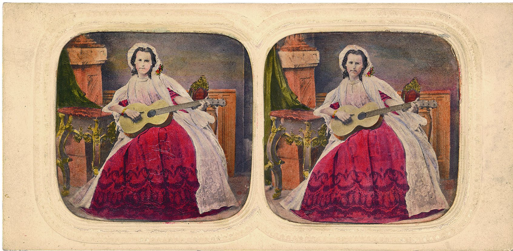
Schwestka Studio, 1859 / 1960, portrait of actress Floriana Jaich