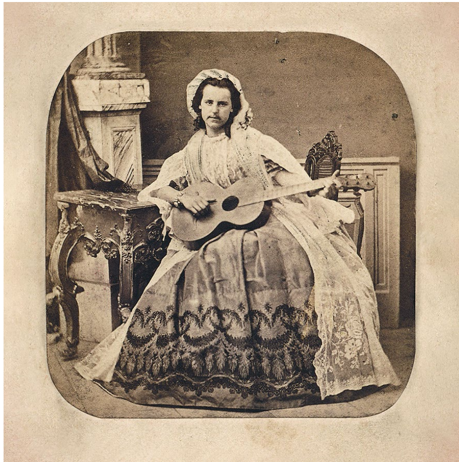
Schwestka Studio, 1859, portrait of actress Floriana Jaich